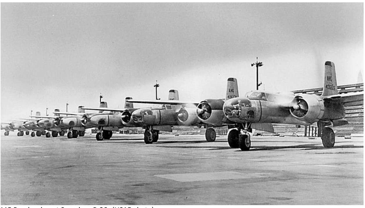
115 Bombardment Squadron B-26s