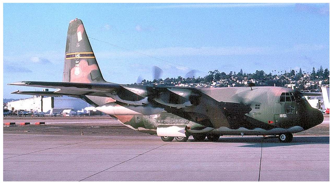
115 Tactical Airlift Squadron C-130